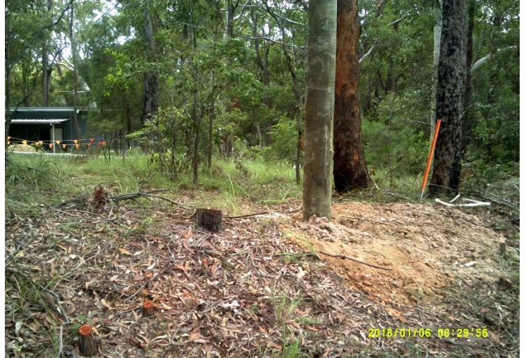
The base of the pole with shed in the background.

Then the Saga really begins. It goes on and on, with the blind leading the blind in seeing we are in need of the power to further our aims of Men's Health and making several contributions to our local society.