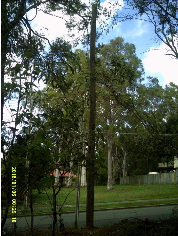
Here is the start of the new power. "Pole up"

Well on the 10 th of April a TEAM of men and big equipment did a bit of digging and had an erection, with a new Pole rising in readiness for the 3 phase power to be installed. Glad we are not having a nose bleed waiting.