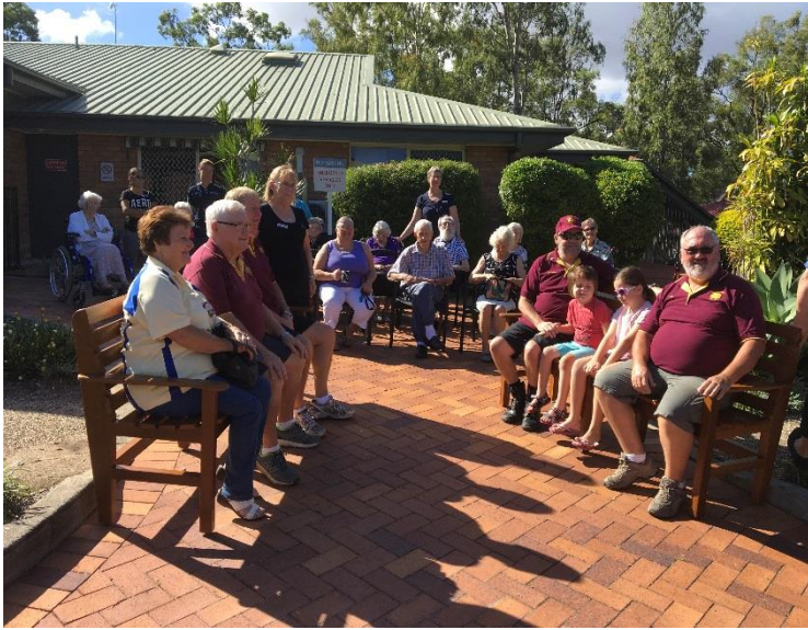
Benches under Load test