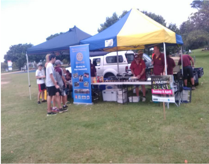
Sausage Mission control Centre with Staff.

As a large proportion of our shedders are of mature age and some may be thinking of moving into a retirement village. I just thought I would put in a Note of possible warning.