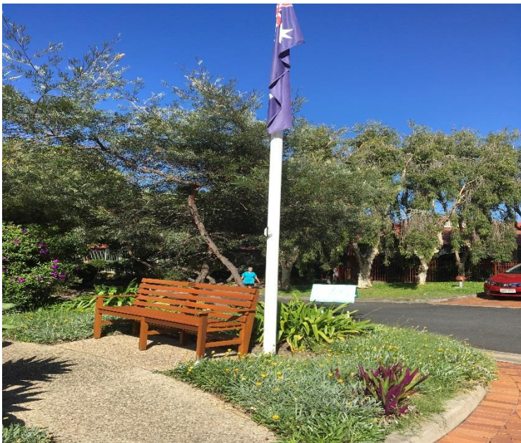
Bench not under load test

The next meeting in May on 'the 1 st Tuesday it will be discussed with all hands a proposal that the annual fees for membership at the shed be increased in line with current expenses. The current $35.00 does not cover the real expenses of operations at the shed. It is contemplated that we should increase the fee to around $50.00 and this would come into effect in July if so approved.